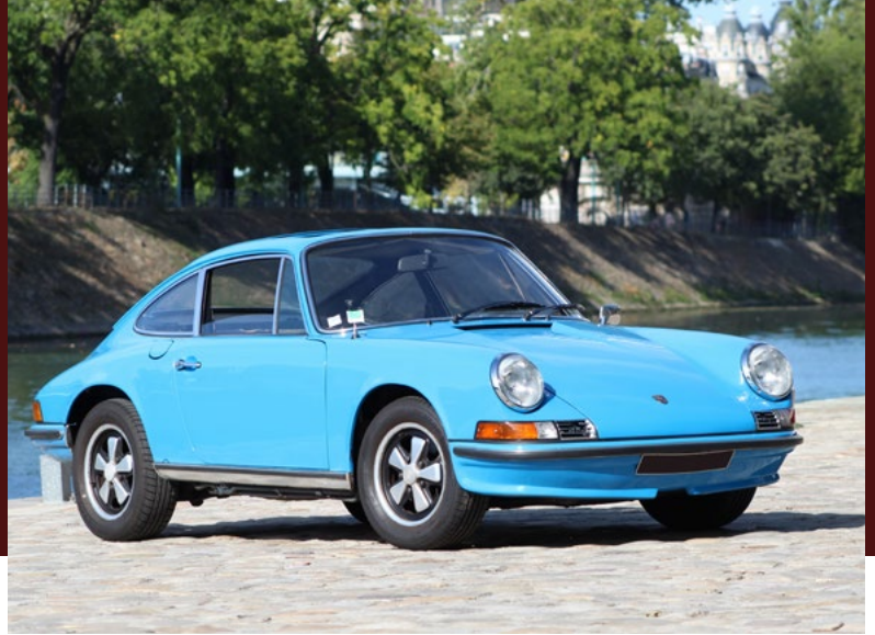
1972 Porsche 911 2.4S Estimate : 150 000 - 200 000 €