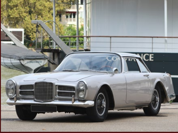
1962 FACEL II Private collection Estimate : 180 000 - 280 000 €