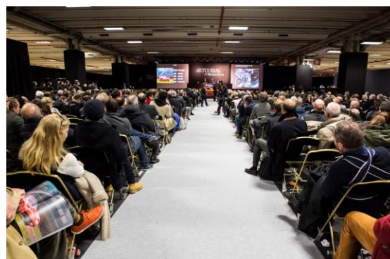
The Rétromobile 2017 sale by Artcurial Motorcars