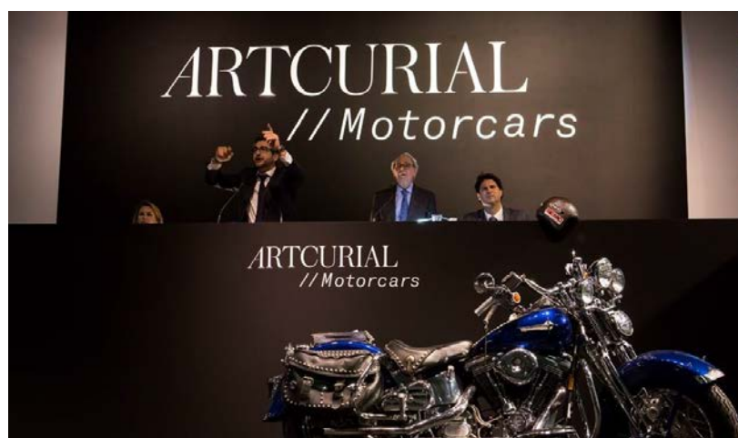
Lot 126: 1989 Harley Davidson softtail springer 1340 CC, sold 280 000 €. Offered by Johnny Hallvard for the charity La Bonne Etoile AUCTION WORLD RECORD FOR THIS MODEL

The “Raging Bull” Collection of 5 exceptional Lamborghinis, including a rare Miura SV (lot 75), also attracted much attention and fetched a total of 2 960 400 / 3 138 014 $.