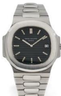
Patek Philippe, Nautilus, ref. 3700/IA, circa 1980, from the Arman collection (estimation : € 16,000 - 18,000 / $17,600 - 19 800)

COLLECTOR TIMEPIECE AUCTION 17 th JULY 2017