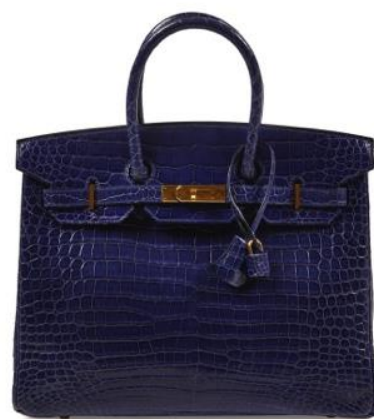
Hermès, Birkin bag, 35 cm, 1996, Sapphire blue estuary crocodile (estimate: €35,000 - 45,000/ $38,500 - 48,500)

COLLECTOR TIMEPIECE AUCTION 17 th JULY 2017