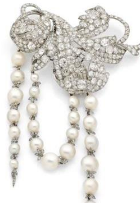
ALTENLOH, Platinum and yellow gold broche 18k set with antic-cut diamonds, with three fine pearls, end of the 19th century LFG certificate (estimate: €25,000 - 35,000 / $26,177 - 37,204)

Pénélope Blanckaert, Director Hermès Vintage & Fashion Arts, Artcurial