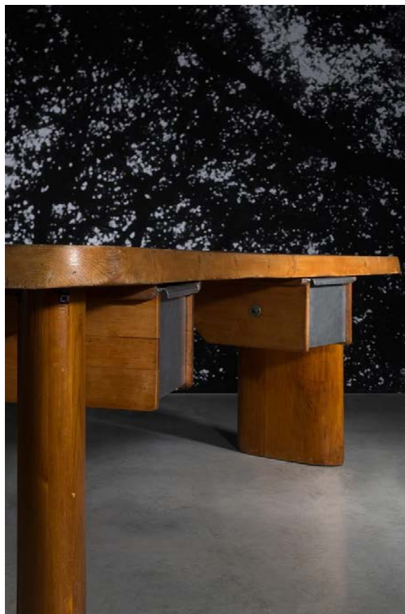
Charlotte Perriand, « en forme » desk, 1943/1944, former desk of Pierre Jeanneret, estimate : 300 000 - 400 000 € / 330 000 - 440 000 $