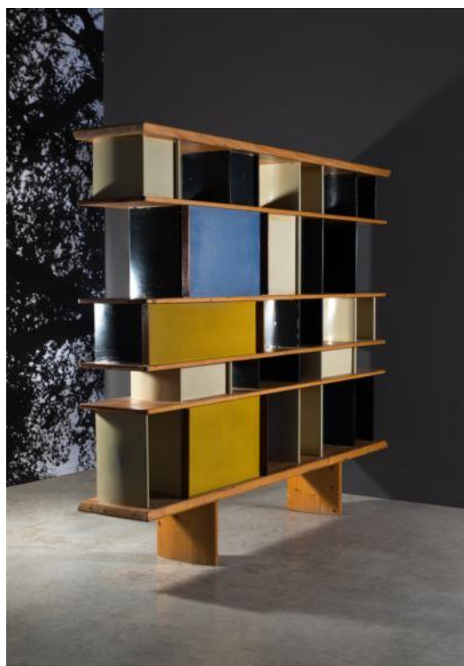
Charlotte Perriand, bibliothèque Maison du Mexique , 1952, acajou, estimate : 80 000 - 120 000 € / 88 000 - 132 000 $