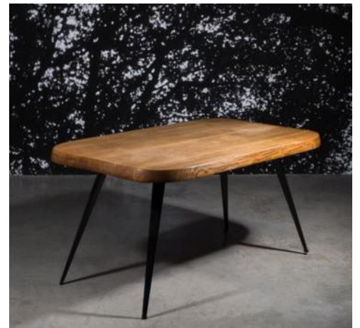
Charlotte Perriand, table 6 couverts , 1958, Steph Simon edition, estimate : 20 000 - 30 000 € / 22 000 - 33 000 $