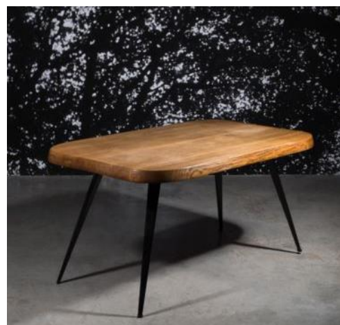
Charlotte Perriand, table 6 couverts , 1958, Steph Simon edition, estimate : 20 000 - 30 000 € / 22 000 - 33 000 $