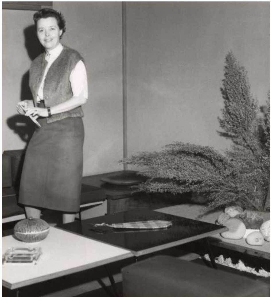
Charlotte Perriand at home in Tokyo, 1954