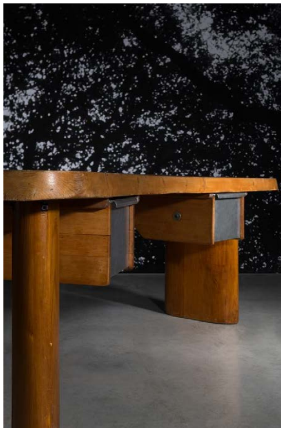
Charlotte Perriand, « en forme » desk, 1943/1944, former desk of Pierre Jeanneret, estimate : 300 000 - 400 000 € / 330 000 - 440 000 $