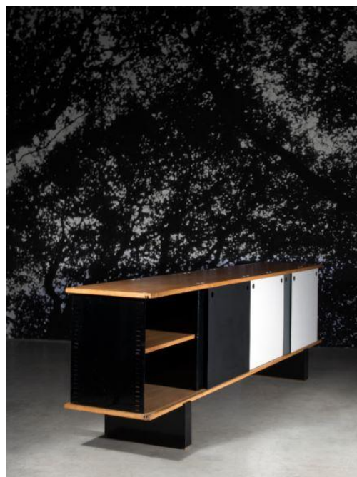
Charlotte Perriand, bahut Cansado , 1959-1963, Steph Simon edition, estimate : 35 000 - 45 000 € / 38 500 - 49 500 $

In the years 1950's, her furniture is displayed alongside that of Jean Prouvé and Serge Mouille, in the Steph Simon gallery, located on the Boulevard Saint-Germain, Paris. At a time when concrete is king, Charlotte Perriand stands out from the masses with her creations that focus on the warmth of wood. The table called « Forme libre » in solid mahogany from 1958