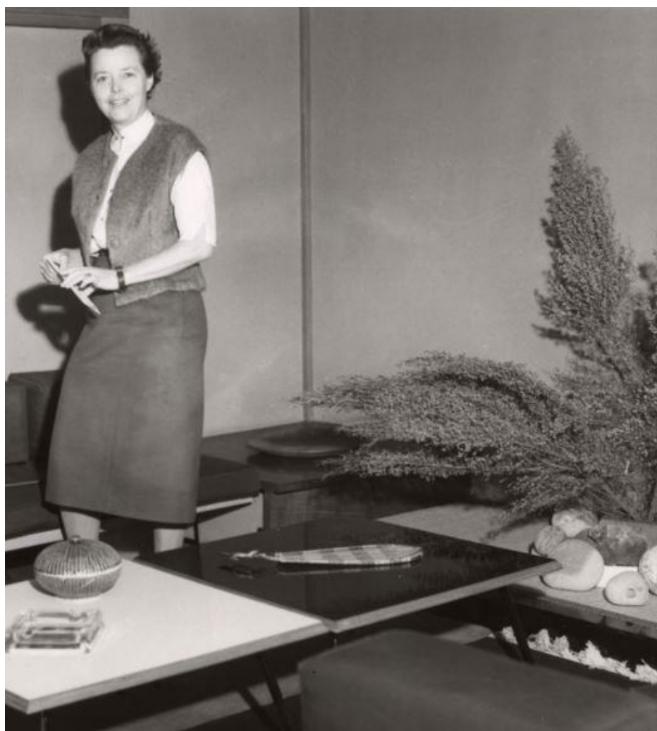
Charlotte Perriand at home in Tokyo, 1954