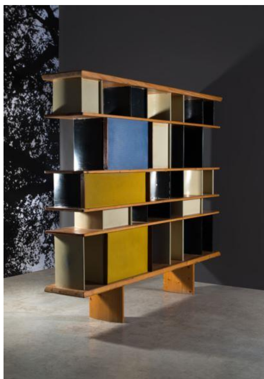
Charlotte Perriand, bibliothèque Maison du Mexique , 1952, acajou, estimate : 80 000 - 120 000 € / 88 000 - 132 000 $