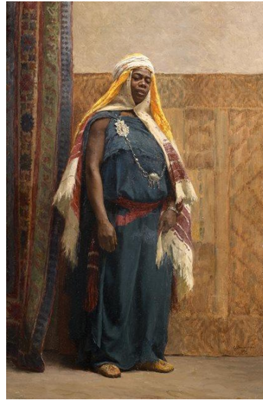
Georges Bretegnier, Marocaine , 1890, oil on canvas, estimate: €15,000 - 20,000 / $16,500 - 22,000

The piece presented by Artcurial represents two people playing cards, a subject rarely executed by the artist. A carpet, a mother-of-pearl inlaid box, a blue ceramic vase, a teapot placed on a copper tray and a narghile establish the decor. These objects are a reference to the large collection of memories brought back from Rudolf Ernst's trips to the Orient, and kept in his studio. The artist's passion of colours and textures is reflected by the use of wood panel rather than a canvas, giving the colours a radiant look. The finely engraved lines confer texture to the painting and add a feeling of realism to which is in fact, an scene imagined by the master.