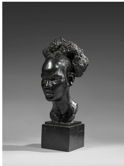
Anna Quinquaud, Dico , bronze with dark patina, estimate: €30,000 - 40,000 / $33,000 - 44,000