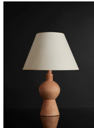
Alberto Giacometti, Lampe Bilboquet , circa 1937, patina terra cotta lamp, estimate: €50,000 – 60,000 / $55,000 – 66,000