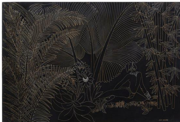
Jean Dunand, Femme dans la végétation , circa 1930, black lacquered wood panel with incised gold and silver decor, provenance: artists family, estimate: €80,000 - 100,000 /$ 88,000 - 110,000