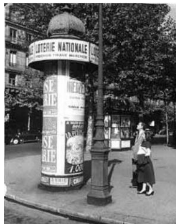
Morris column

An exceptional set of Jean Dunand items, provided by the artist's family will be represented at auction. Among the furniture, an entirely lacquered Bed , decorated with an eggshell bird motif (estimate: €40,000 – 50,000/ $44,000 – 55,000).