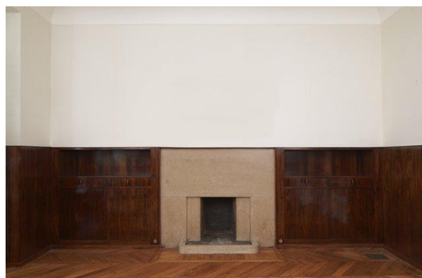
Pierre Chareau, cheminée et boiseries , 1922, Burgandy stone fireplace and rosewood panel, estimate : €20,000 - 25,000/ $22,000 - 27,500