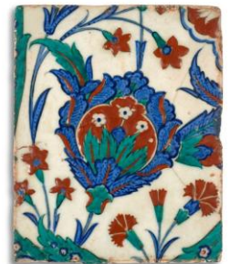
Pomegranate tile, Iznik, Ottoman art, 16 th century, estimate: €8,000 - 10,000 / $8,800 - 11,000