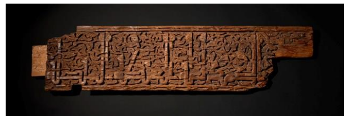
Wood beam with calligraphy inscriptions, Spain. Nasride art, 14 th century, estimate: €12,000 - 15,000 / $13,200 - 16,500

Ottoman art will also be represented by a calligraphy Koran by Mohammed Nouri. Dated 1252 A.H/1837 A.D, this very beautiful manuscript is finely penned in Nashhi characters separated by a gold rosette. The titles are marked in white in the illuminated gold background of the cartouches (estimate: €5,000 – 6,000 / $5,500 – 6,600).