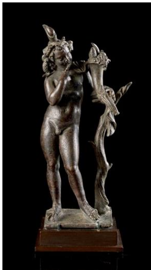
Statuette d'Harpocrate in bronze, Egypto-Roman Art, 1st century B-C, haut. : 13,3 cm, estimate : €50 000 -60 000 / 55 000 - €60 000