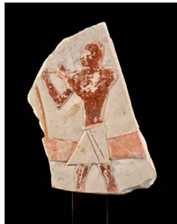
Limestone relief, Egypt, Saite period, 7 th century B.C., red pigment, height : 22,2 cm, estimate : €14,000 - 18,000 / $15,400 - 19,800

In the Roman art section, a marble Head of Minerva , dated from the second century (estimate: €40,000 – 50,000 / $44,000 – 55,000). Cycladic Art will be represented by an Anatolian marble idol, "Stargazer", dated from the 3 rd millennium B.C. The figure is of Kaliyah type, standing with his legs together and finned arms slightly detached from the body. (estimate: €15,000 – 18,000 / $16,500 – 19,800).