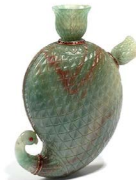
Jade Hookah base, Moghul India, 19 th century, estimate : €10,000 - 12,000 / $11,000 - 13,200

This boteh shaped receptacle whose base extends into a parakeet head is finely sculpted with scales and a petal corolla.