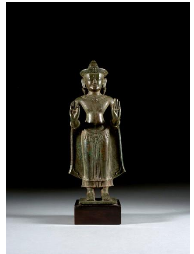
Vishnu statuette, bronze, Cambodge, Khmer Art, Angkor Vat style, middle of 12 th century, estimate: €15 000 - 20 000 / $16 500 -22 000