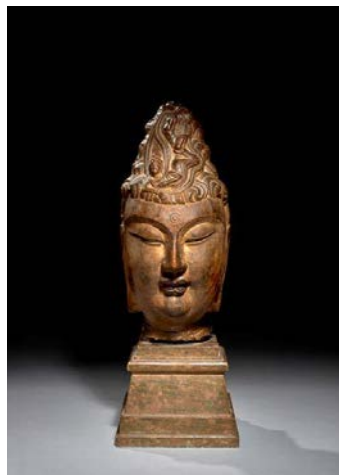
Importante Guanyin grey stone head, China, Song Dynastie (960-1279), estimate: €10,000 - 15,000 / $11,000 - 16,500

Dating from the Song Dynasty, this grey stone Guanyin head also presents a serene face. Its eyes are half-closed, its super ciliary arches protruding and his forehead is marked with the urna (third eye). The contour of the face is characterised by elongated ears lobes and the hair is sculpted in swirling loops covering the Usnisha (turban) and crowned with an Apsara (nymph) on the front of the head.