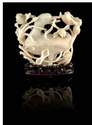
Covered box, celadon pale jade, China, Qing Dynastie, 18 th -19 th century, estimate: €15,000 - 20,000 / $16,500 - 22,000

Made of celadon pale jade, this covered box represents a standing duck, the head turned toward the rear and holding in its beak a winding branch laden with Lotus flowers, buds and foliage. It rests on a base in sculpted wood base representing turbulent waters and Lotus leaves and flowers.