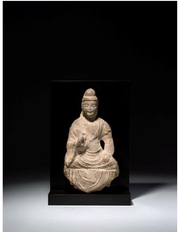
Buddha Statue, grey limestone, Chine, Longmen site, Tang period (618-907), estimate : €30 000 - 40 000 / $33 000 - 44 000

This statuette represents Vishnu in frontal position, the two hands in Abhaya mudra stance (right hand is lifted, palms turned toward the outside, fingers stretched upwards), offering a gestural symbol of comfort and protection. The god is dressed in a Sampot maintained at the waist by a belt decorated with pendants, his naked torso adorned with a necklace. His face is serene and his hair is tied back in conical bun and crowned with a tiara. Appearing in the late Khmer art toward the middle of the 17 th century, this unusual image of Buddha in royal attire separates itself from the MON Buddha representations in the Dvaravati period (15 th -20 th centuries). Crowned Buddha's of this type are associated both with Angkor and to Buddhist art of Lopburi.