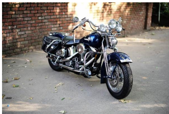
Harley-Davidson Softail Springer 1340cc, starting bid: 20 000€ (20 800$)

Johnny Hallyday has also decided to sell his Harley-Davidson Softail Springer with Evolution 1340 cc engine, to raise money for his wife Laeticia's charity. This bike is known to the public, having starred on the cover of his single Possible en moto , released in 1989.