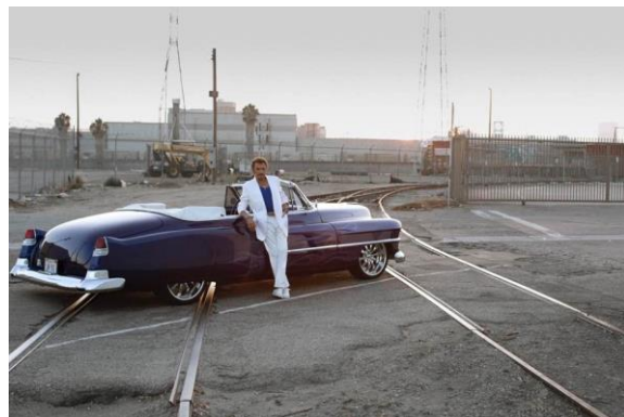
Johnny Hallyday and his 1953 Cadillac Serie 62 cabriolet - 1953 Cadillac Serie 62 cabriolet, customized by Boyd Coddington, starting bid: 50 000€ (52 000$)

Under the watchful eye of Johnny Hallyday, this Cadillac was completely dismantled and transformed in the best traditions of US custom cars. Given special paintwork with ghost flames, a large V8 engine, gleaming chrome and leather upholstery personalised with the rock star's initials, this car possesses all the desirable qualities of a unique collectors' item with outstanding provenance. This fabulous automobile appears on the cover of the album L'Attente released in 2012.