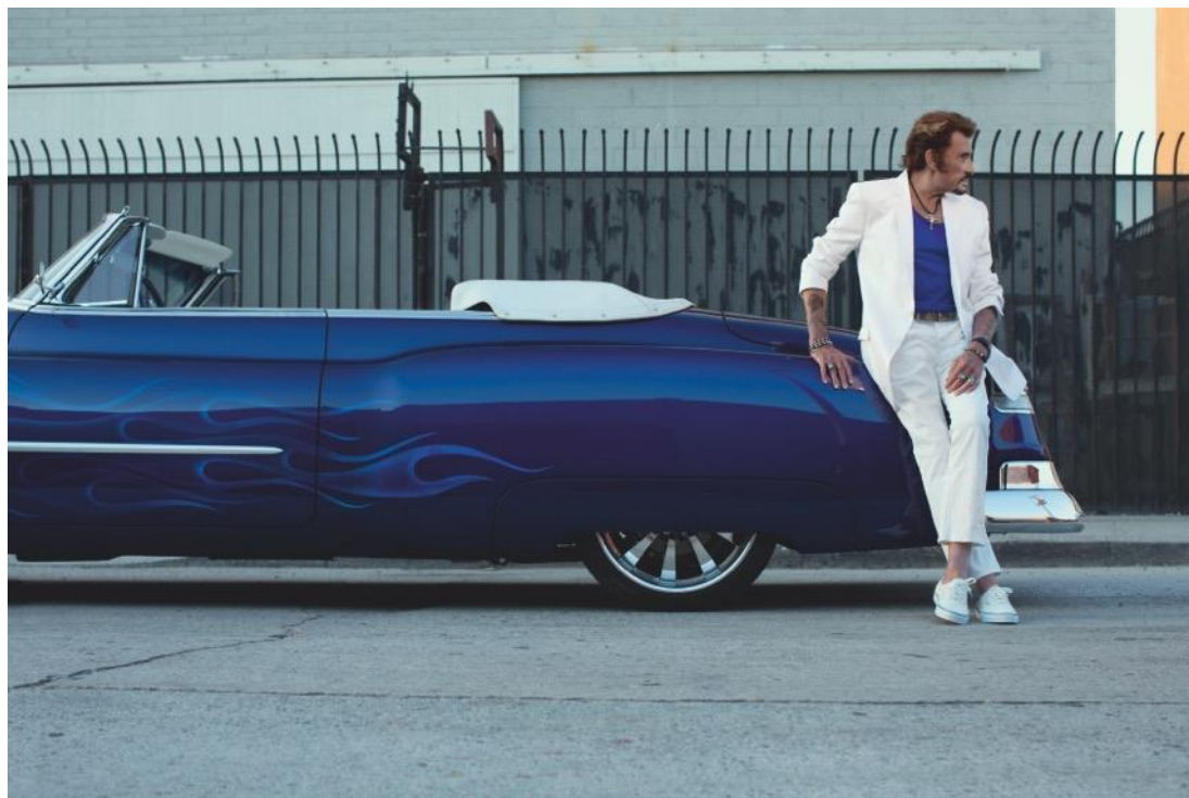
Johnny Hallyday and his 1953 Cadillac Series 62 cabriolet 1953 Cadillac Series 62 cabriolet, fully customized by Boyd Coddington to be offered for sale on 10 February 2017 by Artcurial Motorcars in aid of the charity La Bonne Etoile, starting bid 50 000 € (52 000 $)