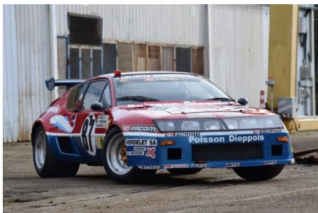
Lot 162 1974 Alpine A310 V6 "Poisson Dieppois " Estimate: 200 000 – 300 000 € 220 000 – 325 000 $