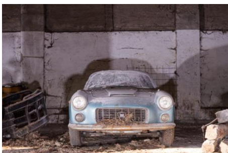
Lot 158 1960 Lancia Flaminia Sport Zagato 2.5L Estimate: 200 000 – 300 000 € - 220 000 – 325 000 $

The Artcurial Motorcars sale at Retromobile would not be the same without a barnfind ! This Lancia Flaminia was discovered in Belgium where it had been stored with other cars since the 1970s, probably since the death of its one and only owner.