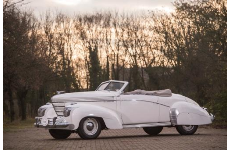
Lot 192 1939 Graham Paige Type 97 supercharged cabriolet Pourtout Estimate: 150 000 – 200 000 € / 165 000 – 220 000 $