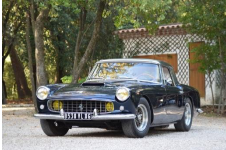
Lot 200 1930 Ferrari 250 GT Cabriolet Pininfarina Series 2 Estimate: 1 400 000 – 1 800 000 € 1 500 000 – 1 900 000 $