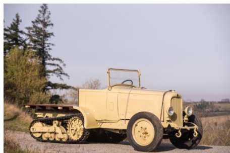
Lot 316 1929 Citroën P19 chenillette Kégresse Estimate: 40 000 – 60 000 € 55 000 – 60 000 $ No reserve

The sale will offer both historic models, including several versions of the famous « Traction », along with the popular models that have played a large part in several generations for the French, from the 2 CV to the CX.