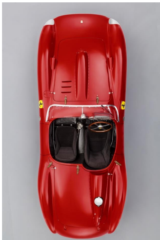
1957 Ferrari 335 Sport Scaglietti • Chassis n°0674 • Pierre Bardinon Collection Estimate : 28 – 32 M€ / 30 – 34 M$

800 MASCOTS FROM THE FORMER PASQUALE GIORDANO COLLECTION