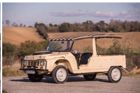
Lot 307 1964 Citroën Méhari 4x4 Estimate: 20 000 – 30 000 € 22 000 – 32 000 $ No reserve