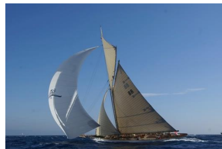
Lot 175 1903 Moonbeam III Dit "Moonbeam of Fife" No reserve Estimate: 500 000 – 1 500 000 € / 550 000 – 1 650 000 $