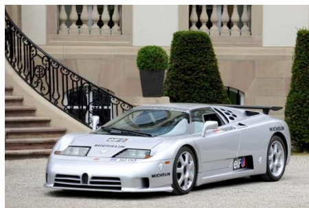
Lot 211 1995 Bugatti EB110 Super Sport Estimate: 800 000 – 1 200 000 € 850 000 – 1 300 000 $