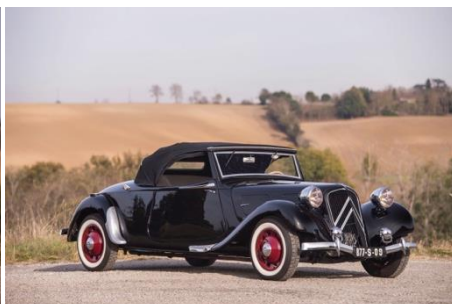
Lot 332 1939 Citroën Traction 11 B cabriolet Estimate: 140 000 – 200 000 € / 150 000 – 220 000 $ No reserve