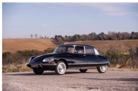
Lot 331 1973 Citroën DS 21 M Prestige Estimate: 30 000 – 50 000 € 32 000 – 54 000 $ No reserve