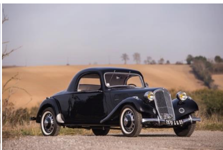
Lot 311 1935 Citroën Traction 7C coupé Estimate: 100 000 – 150 000 € 110 000 – 160 000 $ No reserve