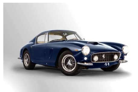
Lot 138 1963 Ferrari 250 GT SWB Berlinetta Estimate: 9 000 000 – 12 000 000 € / 10 000 000 – 13 000 000 $