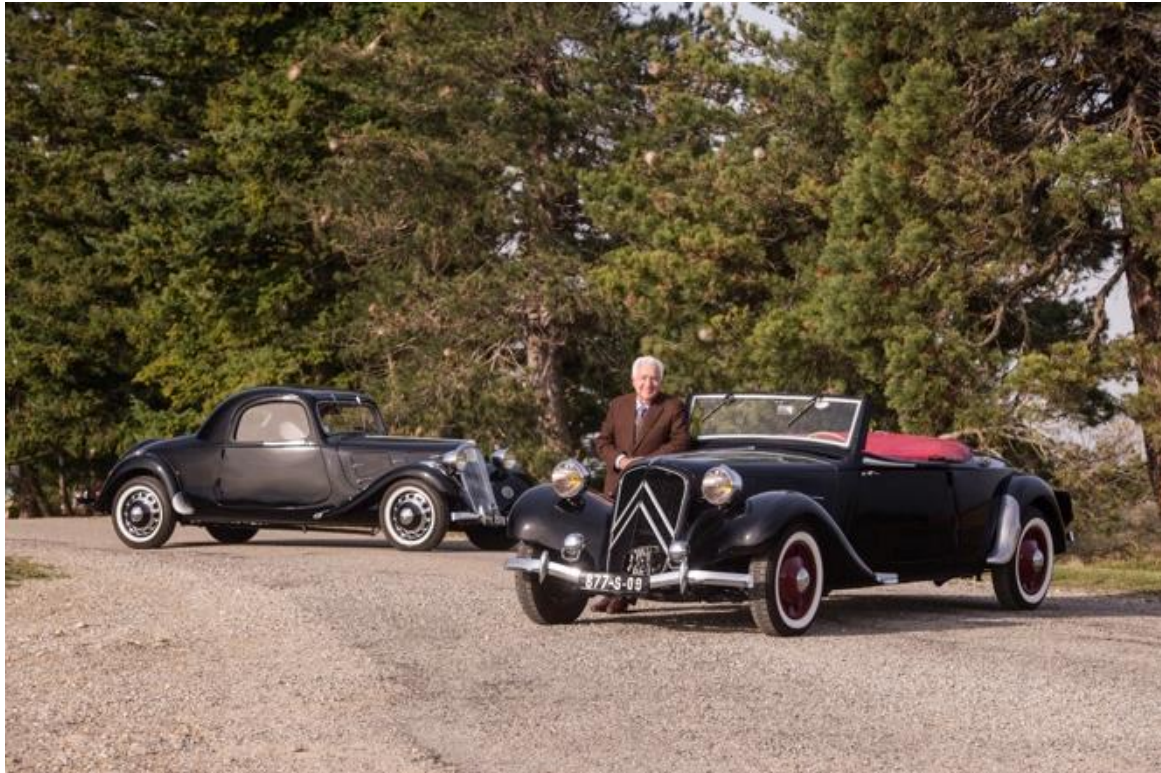
André Trigano with a 1939 Citroën Traction 11 B Cabriolet (estimate : 140 000 – 200 000 € / 153 000 – 218 000 $, no reserve ) and a 1935 Citroën Traction 7C coupé (estimate : 100 000 – 150 000 € / 110 000 – 164 000 $, no reserve)

Paris – The official Retromobile sale by Artcurial Motorcars is one of the most important collectors' car auctions in the world. Collectors and enthusiasts head to Paris every year for this unique event. Last year's sale, starring the Baillon Collection, realised 46 M€ / 52 M$ including premium, making it the largest collectors' car auction ever held in continental Europe. During the sale, Artcurial Motorcars, run by Matthieu Lamoure, sold a 1961 Ferrari 250GT SWB California Spider for 16,3 M€ / 18,5 M$ (inclusive of premium). This was the highest price worldwide for a car sold at auction during the 2014/2015 season, and the highest price for any item across all specialist areas to be sold at auction in France during 2015.