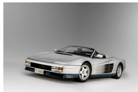
Lot 116 1986 Ferrari Testarossa Spider Valeo Estimate: 680 000 – 900 000 € / 740 000 – 980 000 $ Ex Ferrari Gianni Agnelli