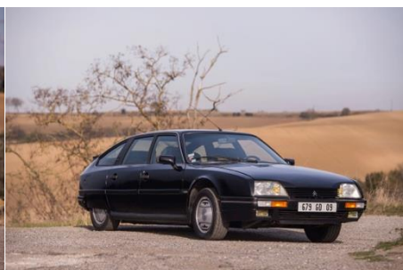
Lot 334 1988 Citroën CX GTi Turbo 2 Estimate: 6 000 - 10 000 € / 6 500 – 11 000 $ No reserve